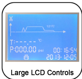
Large LCD Controls