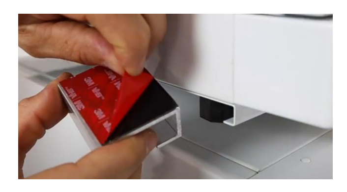
Step 4: Peel off the adhesive backing located on the stacking kit brackets.

Step 3: With a partner, lift the unit onto the desired location on top of the pieces of wood.