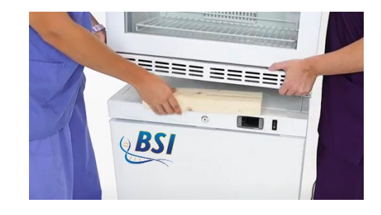
Step 7: Check the placement of the unit and firmly push down.

Step 6: Lift the front end of the top unit and remove the piece of wood and carefully place unit down into place. Repeat on the back end of the unit.