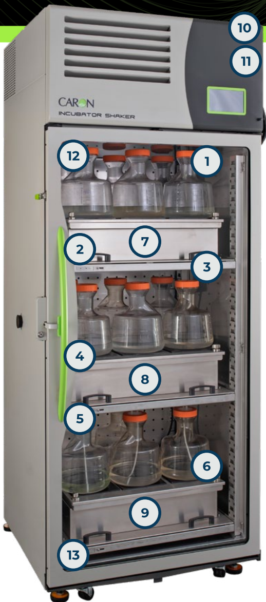
Figure 1. Placement of Geobacillus stearothermophilus BI disks.

The following study demonstrates the ability of dry H 2 O 2 fogging to achieve a 6-log reduction of Geobacillus stearothermophilus 7953 bacterial colony forming units (CFUs) on biological indicator (BI) disks placed in an incubator shaker. G. stearothermophilus is a thermophilic, aerobic, spore-forming bacterium with a thick cell wall. It is frequently used in biological indicators to determine whether resistant forms of bacteria have been destroyed during the sterilization processes. 5