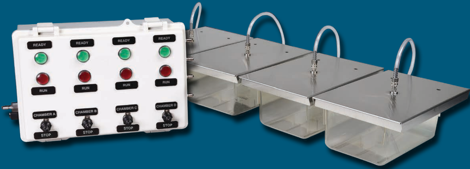
Lids and chambers not included

EA-34004C includes: SMARTBOX® Lab Control Unit and four EA-1130 Lab Unit Hose