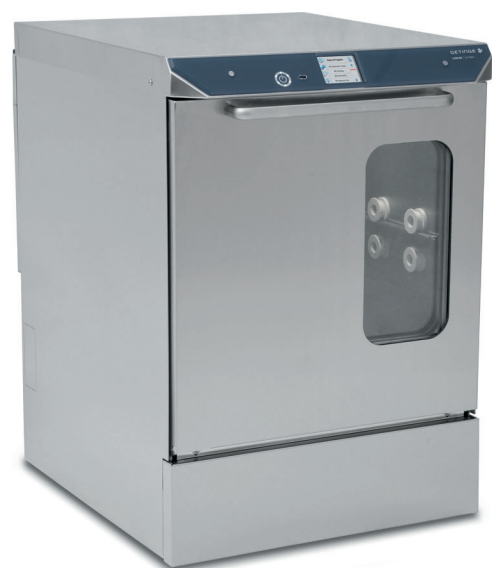
Lancer model 810 LX undercounter labware washer; shown with optional View-In-Process (VIP) window.