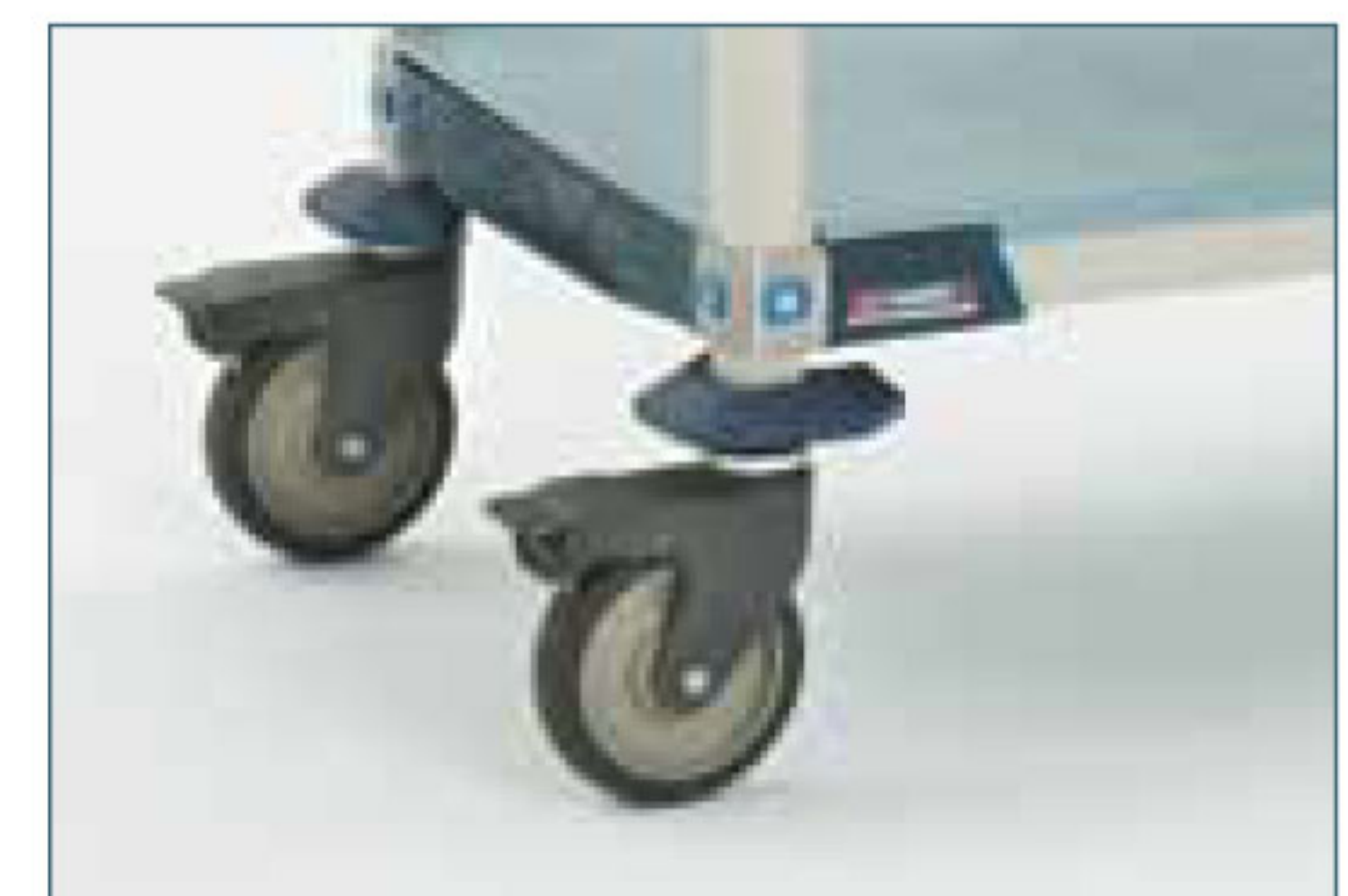
Solid bottom shelf and 5PCX/5PCBX casters pictured

Shelves and posts: pages 14-15 Casters: page 16 Handles: page 17