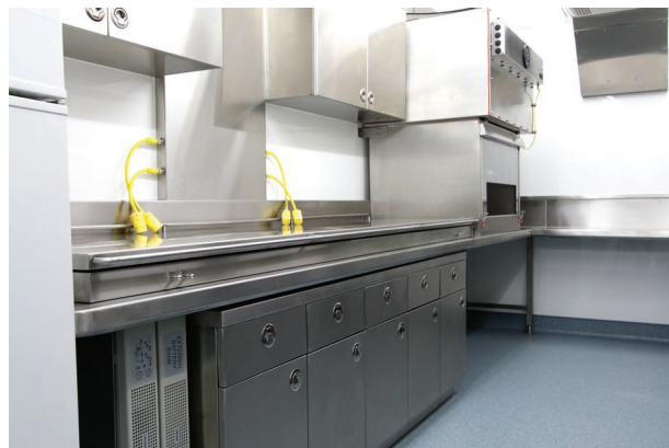
Class II Type A2 Biological Safety Cabinet and Casework inside the BSL-2 Laboratory

A dedicated project manager will oversee all aspects of your laboratory purchase from order through delivery. In so doing, it is possible to guarantee a seamless transition into your bioGO Mobile Biocontainment Laboratory.