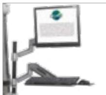
Ergotron® arm for monitor and keyboard/mouse