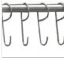
IV Bar - 3 Height Locations - 6 Hooks