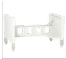
Telescoping Base Stand - Work Surface Height Range 30" - 36" (762 - 914 mm) - Feet Options: Leg Levelers or Casters - Shelf, 8 or 12-inch width - OSHPD OPM Seismic Approved