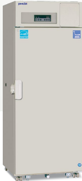
MDF-U731M-PA -30°C Manual Defrost Biomedical Freezer