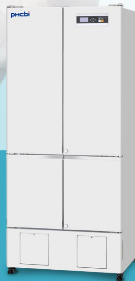
High Performance Model MPR-N450FSH-PA Combo Refrigerator/Freezer