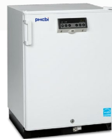
SR-L6111W-PA Undercounter Refrigerator

Storage temperatures specified on pharmaceutical product inserts are categorized as refrigerated or frozen. While frozen products typically tolerate a broader temperature environment, refrigerated products must be kept from freezing.