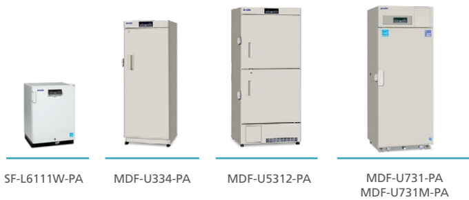
SF-L6111W-PA MDF-U334-PA MDF-U5312-PA MDF-U731-PA MDF-U731M-PA

PHCbi Biomedical Freezers include design and performance properties for storage of pharmaceuticals and biomedical materials that require freezing temperatures for long-term storage at -20°C to -30°C (-4°F to -22°F).