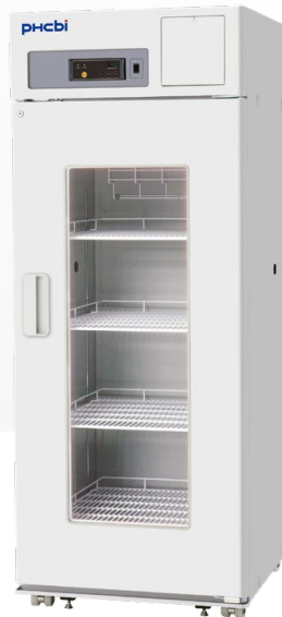
MPR-722-PA Pharmaceutical Refrigerator