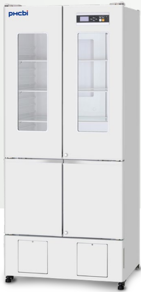
MPR-N450FH-PA Combo Refrigerator/Freezer