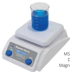
MS-01DUA Digital Magnetic Stirrer