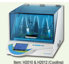
Item: H2010 & H2012 (Cooling)