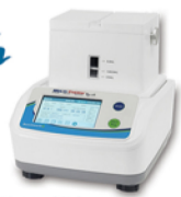
Heated lid prevents condensation & evaporation