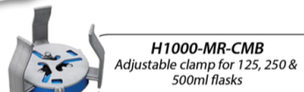
H1000-MR-CMB Adjustable clamp for 125, 250 & 500ml flasks

Receive H1000-MR or H1010-MR w/ purchase of Incu-Shaker Shaking Incubator